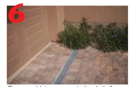
Clean away debris, remove protective plastic if necessary. Seal joints if required.