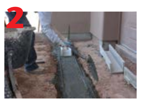
Pour concrete bed - 14" wide by 4" deep, keep outlet pipe clean.