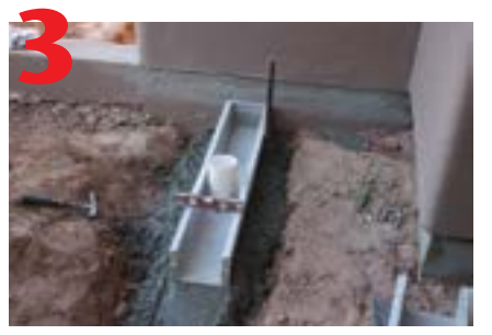
Lay channels starting at outlet. Set a string line at required height to ensure level.